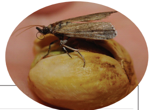
Gargoil® Controls Navel Orange Worm Adults

Infested leaves or shoots were sprayed to runoff with a hand sprayer. After 24 hours, sprayed samples were examined and evaluated microscopically for mortality.